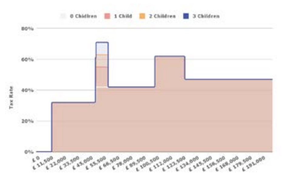
Chart 1: Marginal tax rates and the impact of HICBC (excluding Scotland)<sup>16</sup>

George Osborne claimed that HICBC would only affect the 'top 15% of earners' but in reality it now applies to many households in the lower half of the income distribution. As the threshold has been frozen since its introduction. an increasing number of families have been hit by this charge – impacting ordinary working families who are struggling to make ends meet. Initially, it impacted around 13 percent of families with children (1 million), but it now impacts 26 percent of families (2 million).<sup>17</sup> By 2025/26, 31 percent of families are estimated to be hit by this charge.<sup>18</sup> Wage inflation is leading to many more families crossing the threshold due to a nominal